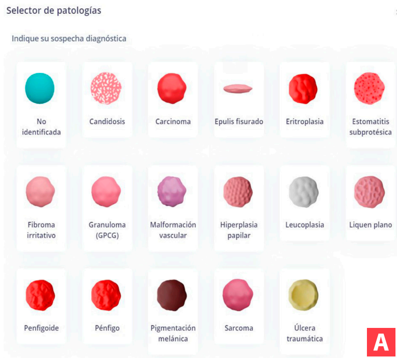
Figure 1. Intraoral examination section interface (Soft tissues and mucosa).