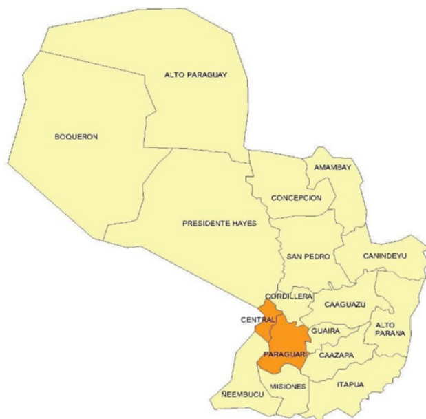
Figure 1. Map of Paraguay. Departments included in the study (Central and Paraguari).