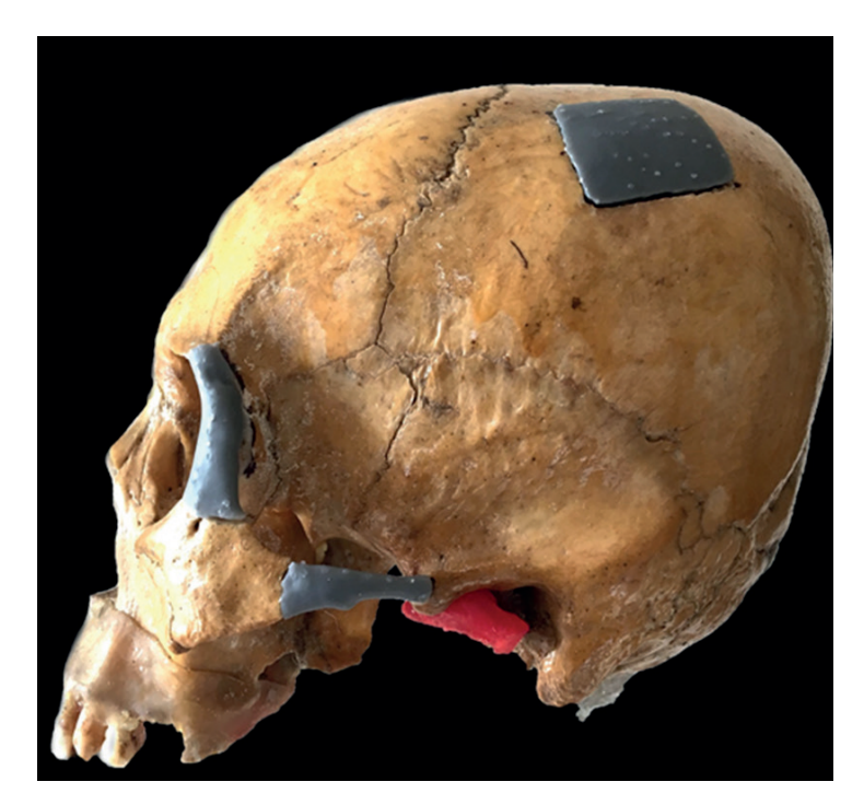
Figure 3. Obtaining and fitting the prostheses by 3D printing.

A: Duplicating and mirroring of the image in the OrtogOnBlender software. B: Image overlapping to digitally cover the defects with the mirror image. C: Selection, customization according to the defect and its volume.