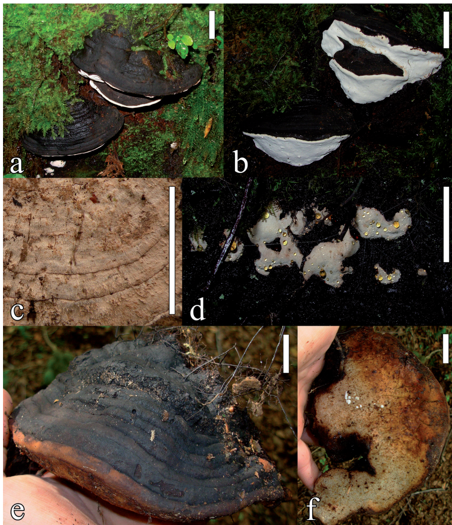
FIGURE 1. Fomitopsis minutispora : a, b. Group of basidiomata on fallen tree; a, b, e. Typically triquetrous basidioma with indurated and sulcate pileal surface; b, d, f. Whitish to yellowish hymenial surface; c. Section through basidioma exposing pinkish brown context and tube layer; d. Resupinate basidiomata. Bar=2cm.

N. nervosa (Phil.) Krasser), suggesting the two latter as preferential substrates, where it may cause significant damage to the standing tree. F. minutispora is distributed in Southern Argentina and Chile, associated to Nothofagus forests. Until now it was only known from lake Lácar basin in Argentina. It should be mentioned that both, the Argentinean and the Chilean collecting areas are at a linear distance of 25–40 km, in similar latitudes (Fig. 3) and within the phytogeographical context of the South American temperate forest, specifically in the forest type of Nothofagus obliqua - N. alpina - N. dombeyi (Donoso 1993). Rajchenberg (2006) pointed out that, apparently, the species is restricted to the relatively temperate climate zones in the Patagonian Andean region.