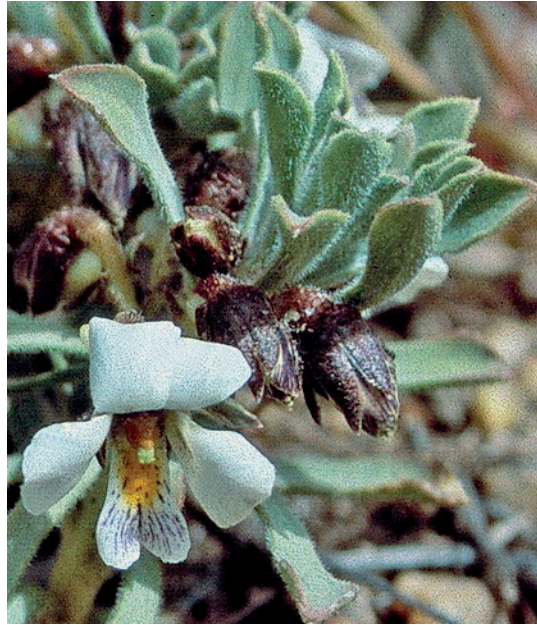
FIGURE 8. V. escondidaensis from population with white-pilose leaves. Pilcaniyeu, Río Negro, Argentina, December 2005.