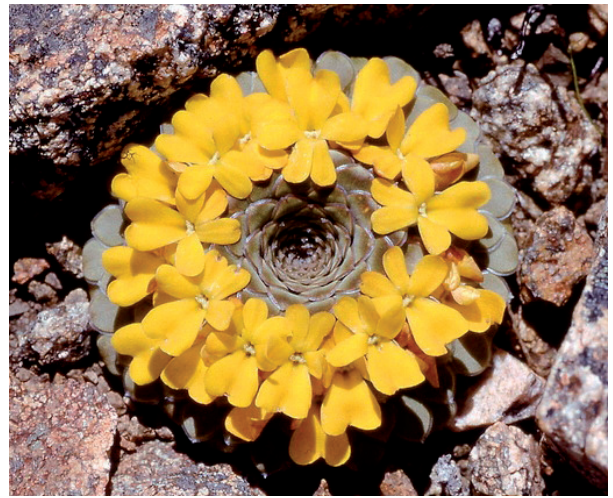
FIGURE 5. Viola coronifera , showing defining ring of upwards-facing corollas on rosette face. Cerro Colohuincul, Neuquén, Argentina, December 1992.