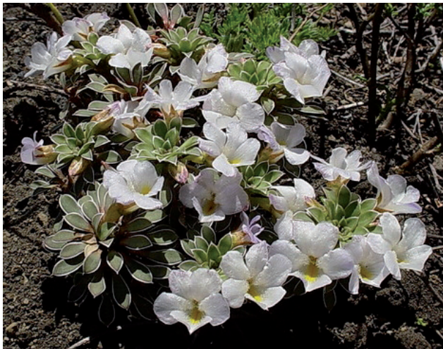
FIGURE 10. A white-flowered Viola cotyledon with the usual much-reduced guidelines. The narrower foliage and lax form are also apparent. Lonquimay Pass, Chile, November 2003.