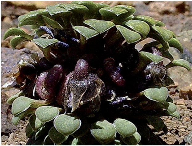
FIGURE 4. V. dasyphylla in early fruit, plainly exhibiting the characteristic dark calyces. Cerro Atravesada, Neuquén, Argentina, December 2007.