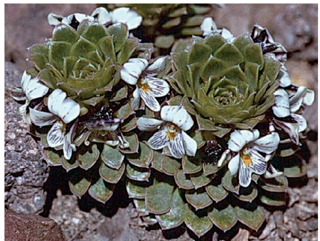
FIGURE 3. Viola dasyphylla displaying typical compact rosette form and black-viscid calyxes. Cerro Chapelco, Neuquén, Argentina, January 1991.