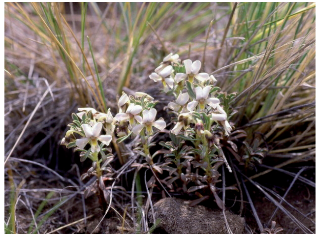
FIGURE 7. Bunchgrass habitat of glabrescent populations of Viola escondidaensis . Tromén Provincial Park, Neuquén, Argentina, December 2002.

FIGURA 6. Planta glabrescente individual de V. escondidaensis con venas fuertemente violetas en todos los pétalos, y tallos rojos. Parque Provincial Tromén, Neuquén, Argentina, noviembre 2002.