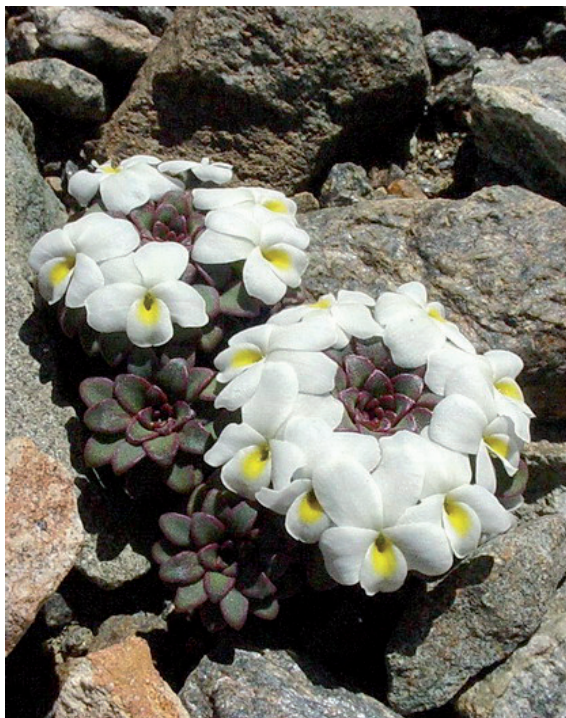
FIGURE 2. Viola sacculus Cerro Catedral, Río Negro, Argentina, December 2002.