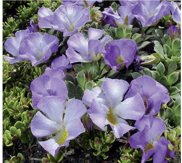
FIGURE 11. V. cotyledon . Volcán Lonquimay, Chile, November 2003.