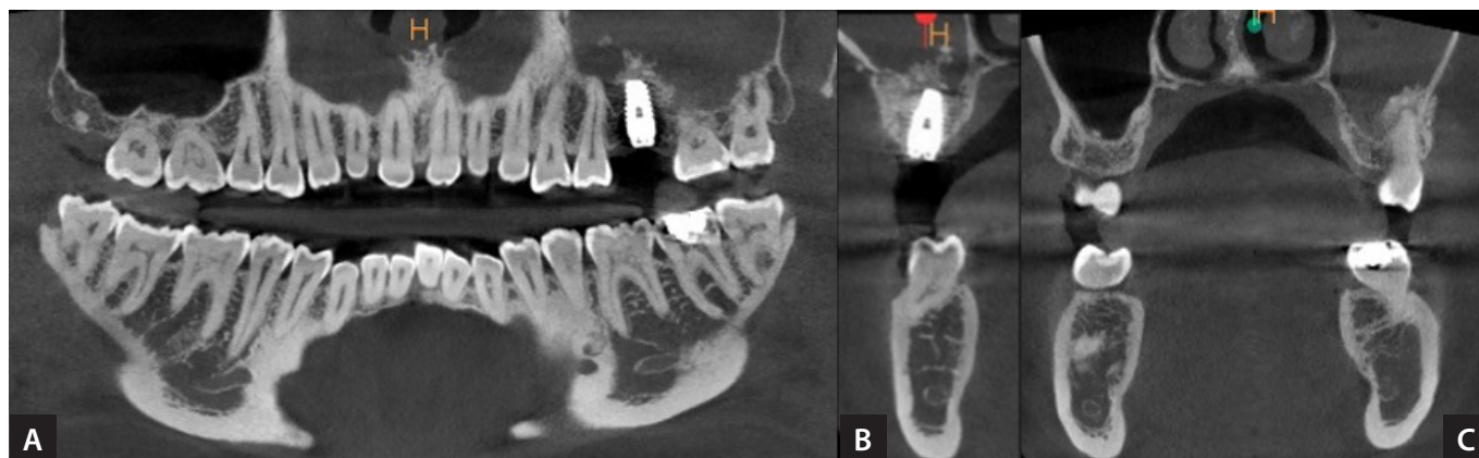
A: Panoramic view. B: Transverse section. C. Frontal view.