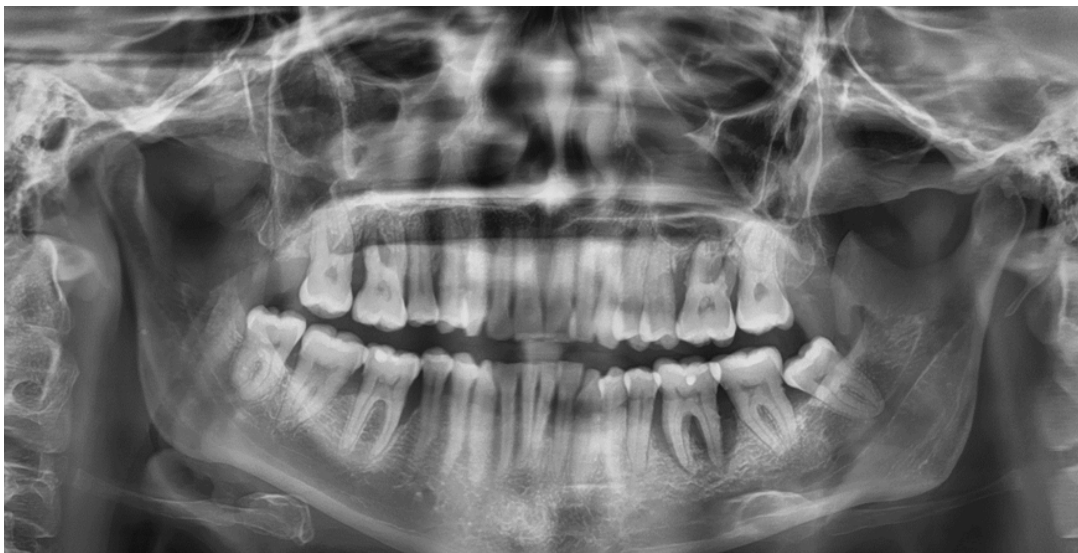
Figure 2. Procedure intrasosseous defects of teeth 4.6 and 4.7.