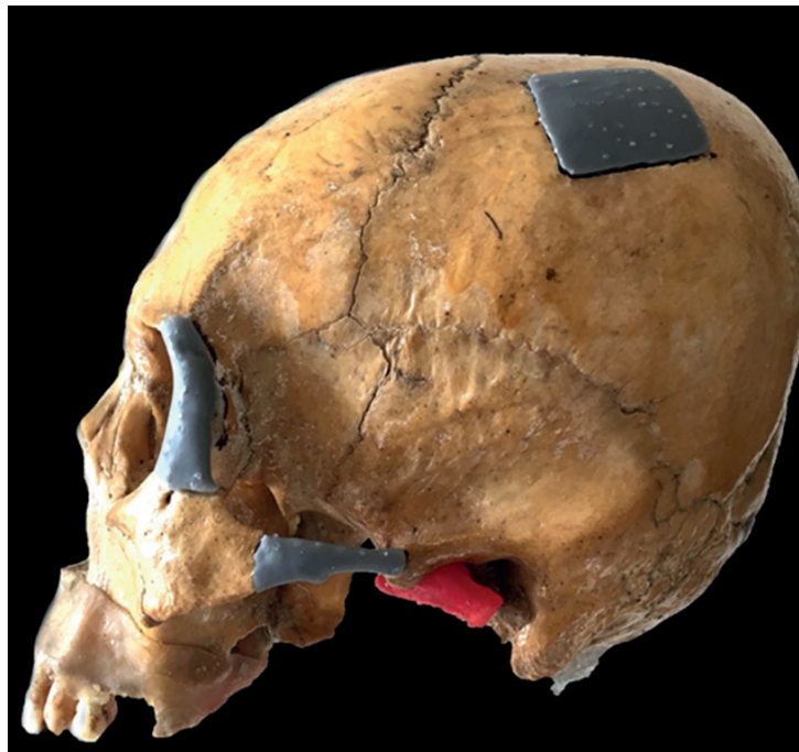
Figure 3. Obtaining and fitting the prostheses by 3D printing.

Obtaining the bone prostheses of the frontal process of the zygomatic bone, the zygomatic process of the temporal bone and part of the parietal bone with a high degree of precision.